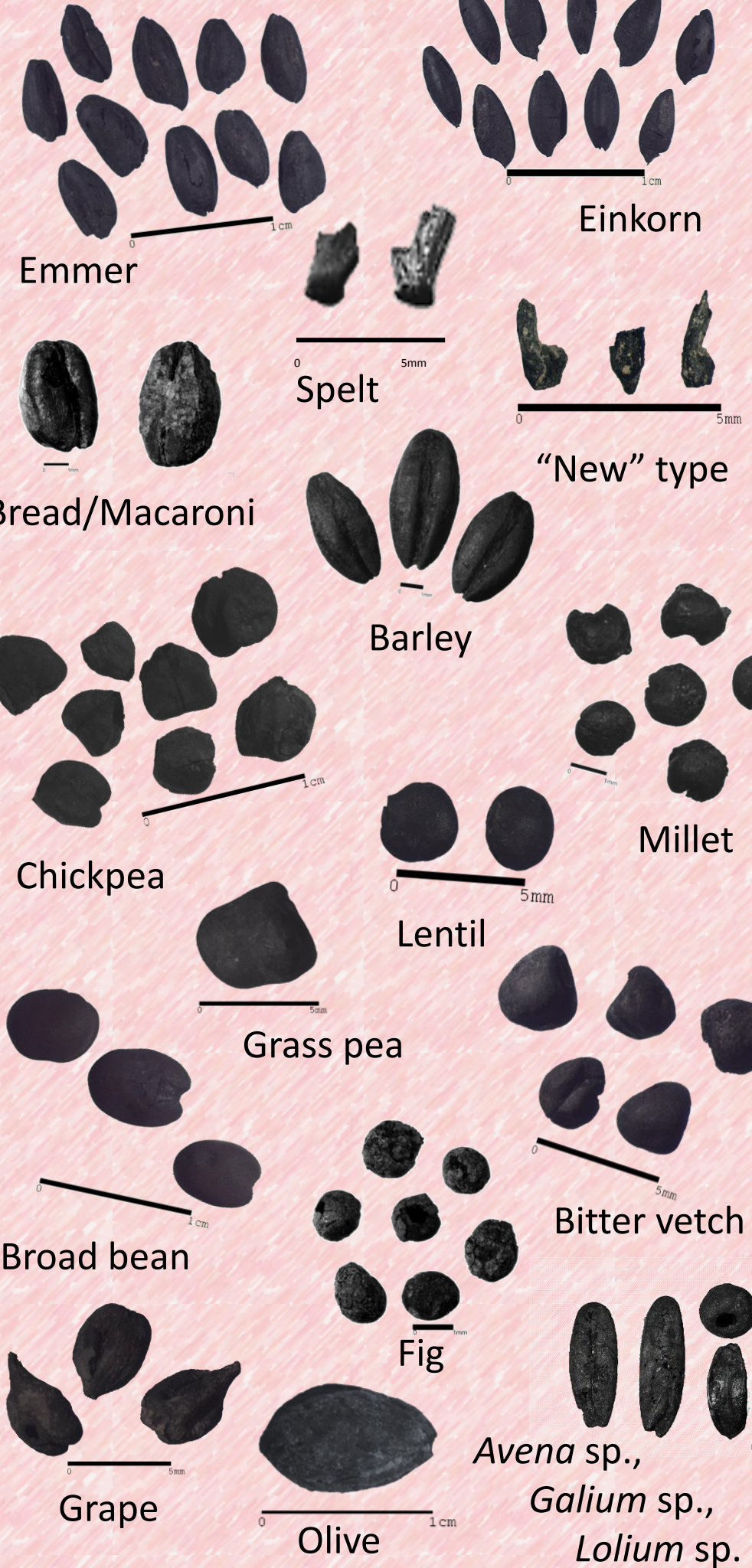
Figure 4: The cereal and pulse species identified. Fig and grape are the most common among fruits/nuts. Olive is only sporadically found at Kynos and Ayios Vassileios. Wild flora seeds are also attested, including typical weed species.