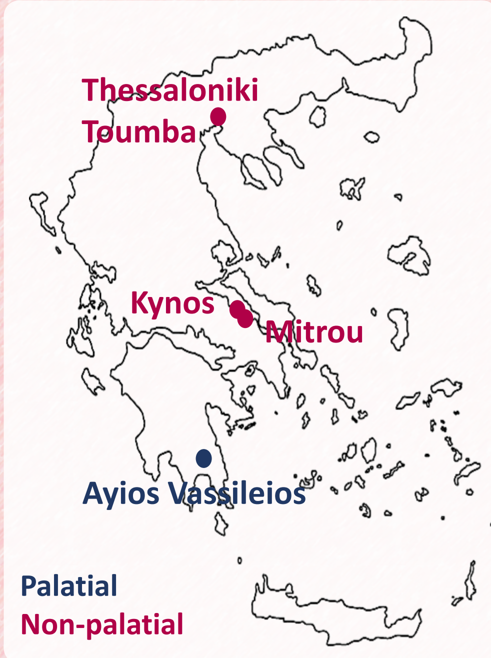
Figure 1: Map of Greece showing the location of the sites studied.